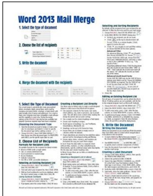
Filesize: 5.91 MB